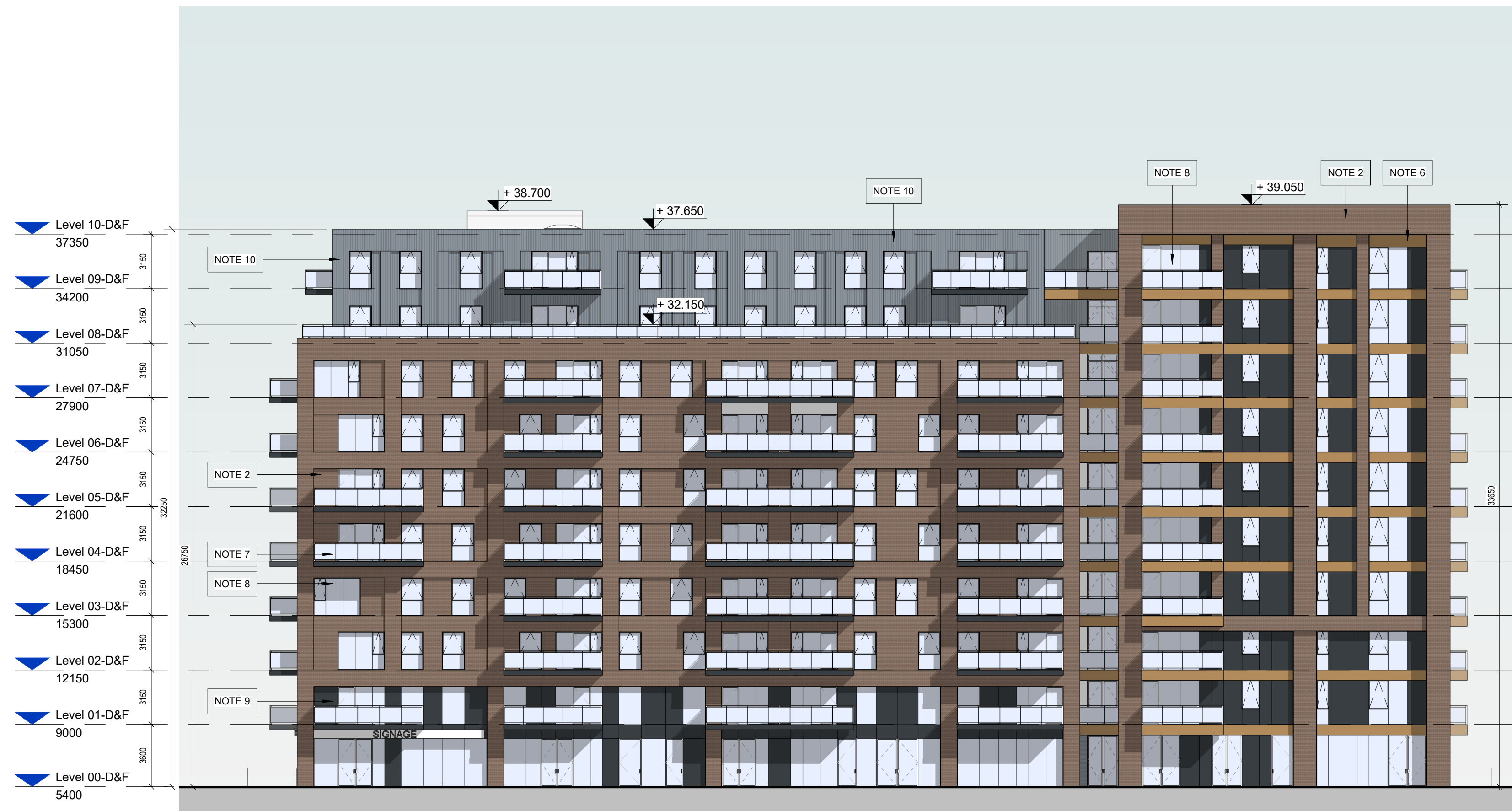
1 BLOCK D-NORTH ELEVATION 1 : 200